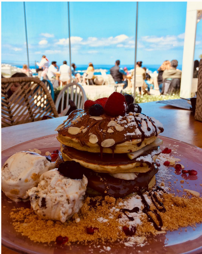
The Liberty Breakfast Room / @thelibertybreakfastroom

Although Liberty is an all-day café, breakfast is the most bustling meal at this cozy restaurant with sweeping, pinch-me-this-can't-be-real views of the Aegean sea. Whether you go savory (poached eggs on brown bread with Naxos Gruyère cheese) or sweet (Nutella pancakes, for the win!), your family will be in good hands. Plus, there's even an area with toys to entertain the kiddos.