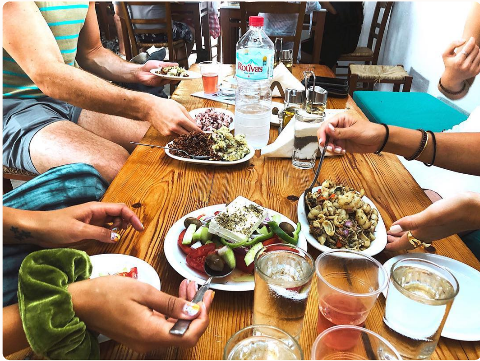
Kiki's Taverna / @morgankei

There's almost always crowds of locals waiting for a table at this popular tavern tucked away on the north side of the island within walking distance from Agios Sostis Beach. While they don't take reservations, Varamili promises the Greek/Mediterranean food is worth the wait—especially the steaks cooked outdoors in a traditional oven.