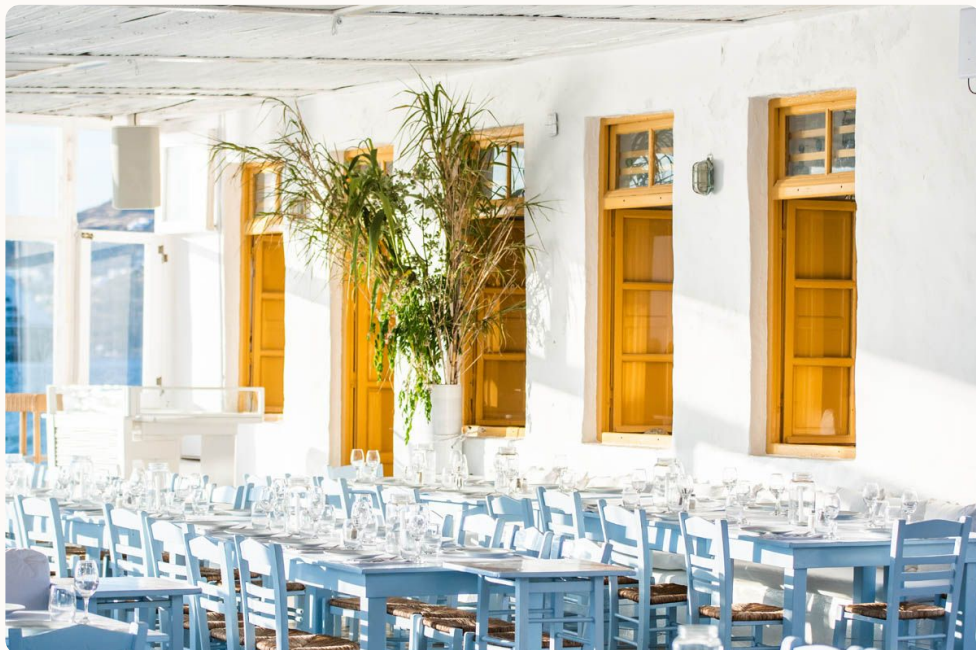
Sea Satin / seasatinbygryparis.com