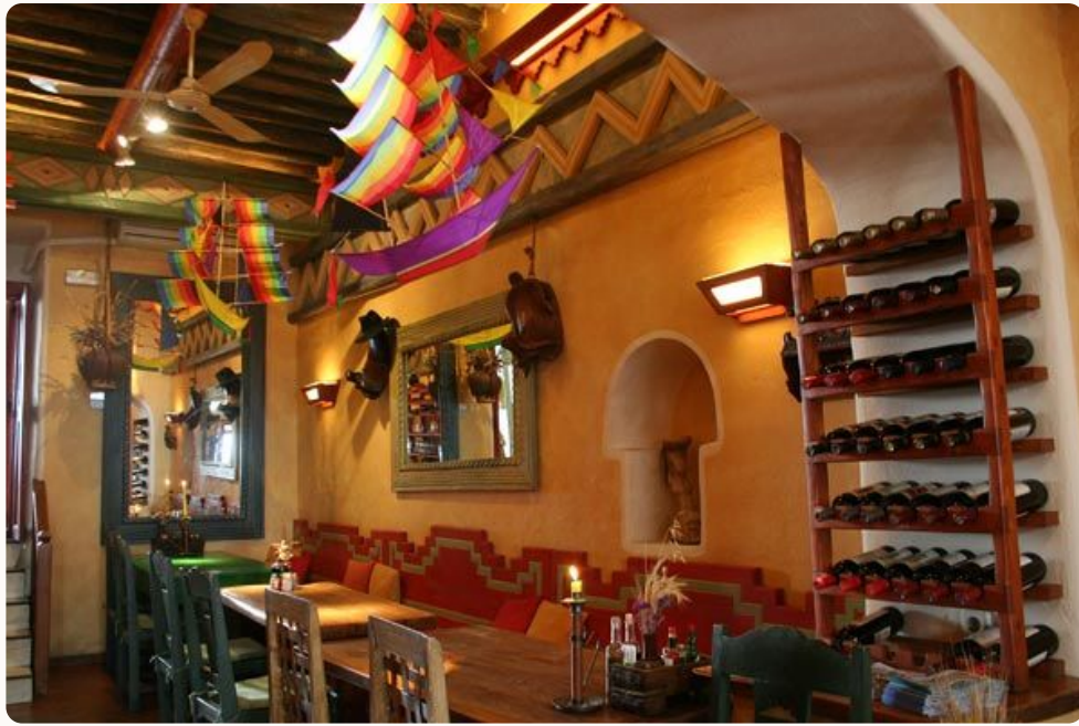
Appaloosa / appaloosa-mykonos.com

Mexican and Mykonos may not sound like the most natural combination, but the crowds of locals swarming Appaloosa for a feast of burritos, tacos and guac say otherwise. There's nothing fancy about it, and yet—if you ask Varamili—that's part of its charm. "It's super cute and simple... many Greek families go there," she says.