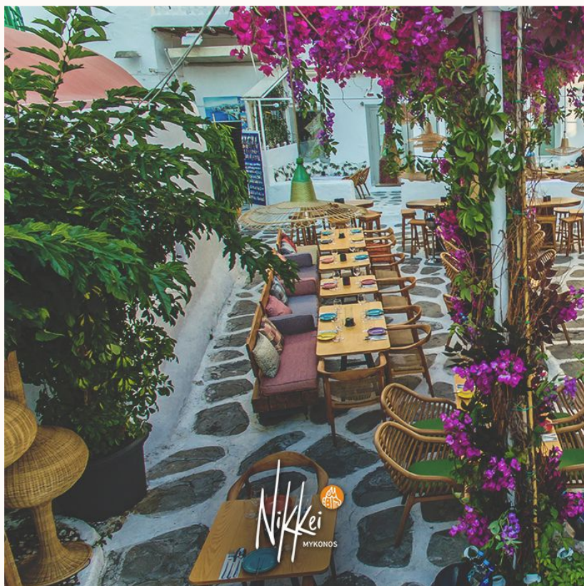
Nikkei / @nikkei_mykonos

Located in the center of town, Nikkei specializes in fusion Peruvian fare prepared using Japanese techniques. With small tables under a charming flowered awning, it's the perfect spot for family dinners.