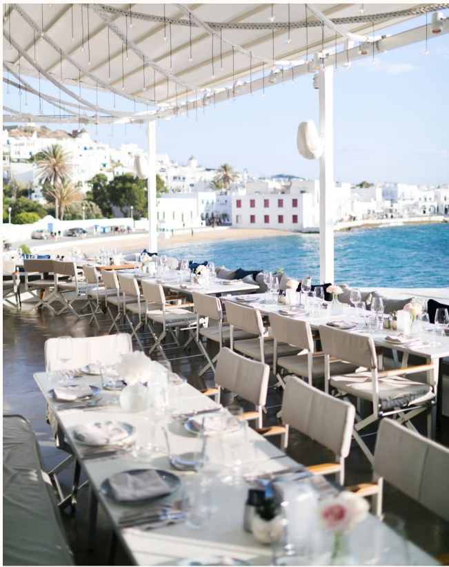
Remezzo / @remezzomykonos

Remezzo leans towards the gourmet side but is still worth checking out for a family dinner because of its enviable view. Just be sure to go on the early side since dancing begins around midnight.