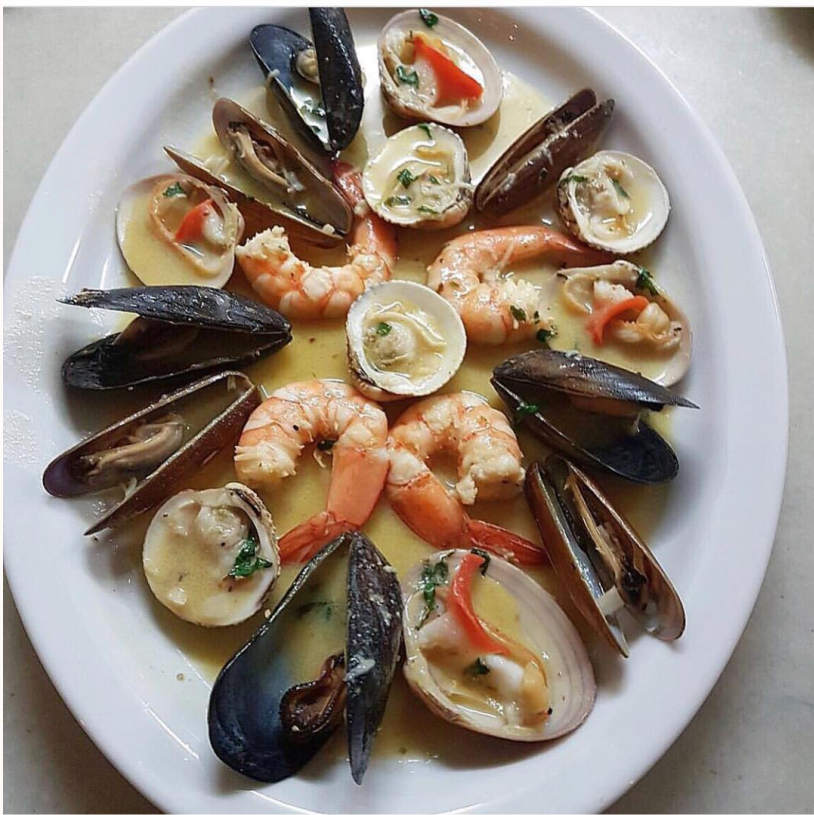
Tsaf / @tsaf_mykonos

This eclectic seafood spot sits at the heart of Ano Mera Village—the second biggest town on Mykonos island that still manages to retain a charming, small-town feel. Lunch on fresh oysters, shrimp, scallops, pasta and more as you keep an eye on the kids playing around the village square.