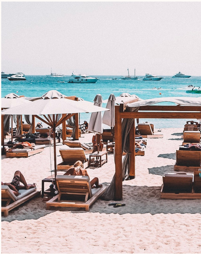
Branco Hotel / @brancomykonos

This hotel on Branco beach, which Varamili describes as "very chill and relaxed" is a great place for a family vacation. Parents with young children can snag some lounge chairs and lazy away the day on this white sand beach for the perfect family holiday.