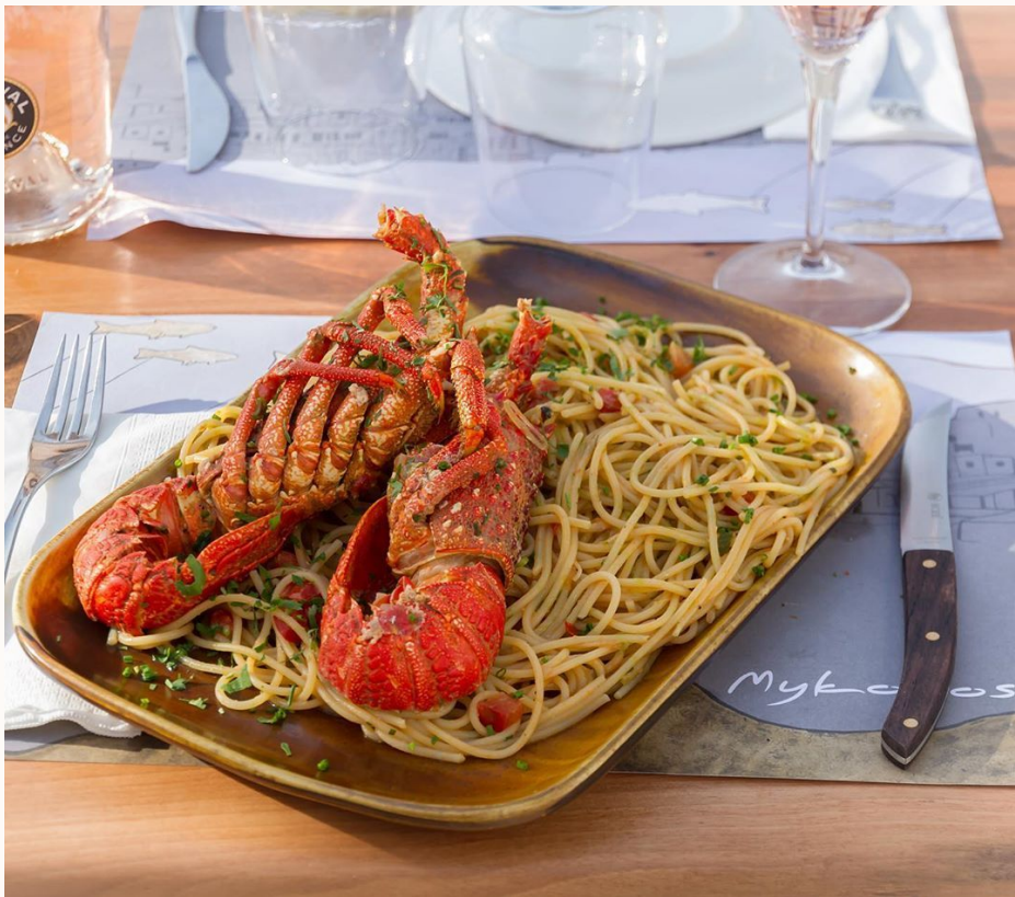
Raya / @ rayamykonos

Raya is an all-day restaurant sitting on the west coast of the island, right by the port bay near the shore of Mykonos Town. Expect elegant—but accessible—local dishes like Greek bruschetta, fried zucchini, shrimp risotto, a slew of salads and more. There's also a dedicated vegan and vegetarian menu.