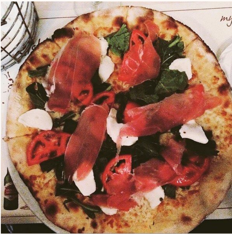
Casa di Giorgio / @casadigiorgio.mykonos

You can't go wrong with great pizza, pasta and risotto at Casa de Giorgio—a chill spot in town for a no-frills Italian dinner at an affordable price. Located in Mykonos town on Mitropoleos Street, it's an ideal location for a post-dinner stroll.