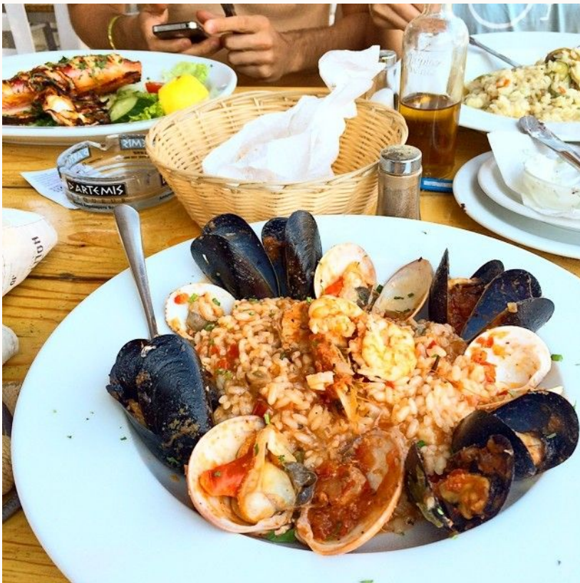
Tasos Taverna / @guilhermecamaratta

Tasos has been dishing out classic Greek fare on Paraga Beach since 1962. Seafood is where they shine (diners walk up to the tank to select which fish they'd like to enjoy that night), but there's also a selection of charcoal-grilled meats and other Zakynthos local foods.